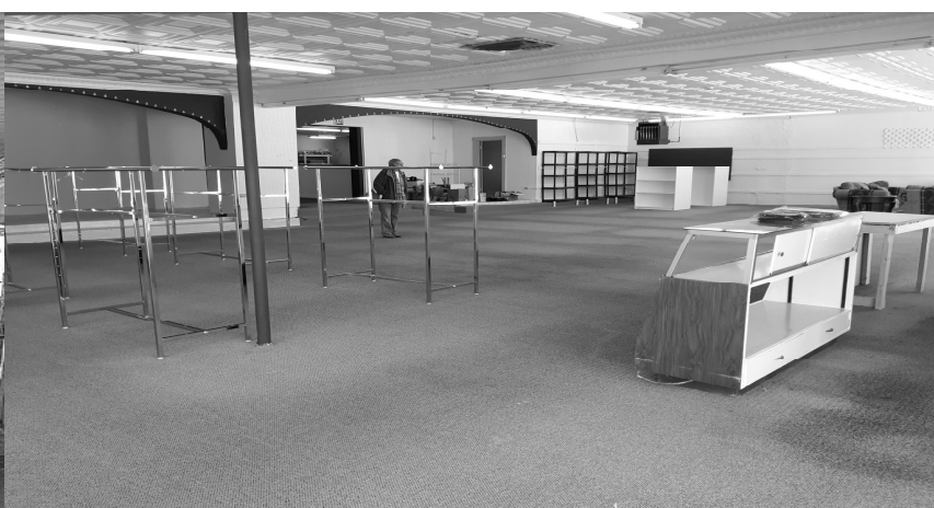
Check out these before and after pictures !!!!